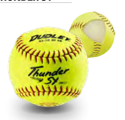
Item# 4A-913Y • Cover: Synthetic • Size: 12" COR: .47 • Compression: 375 lbs.