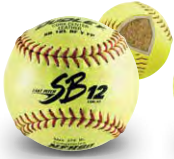
Item# 4H-311Y • Cover: Leather Size: 12" • COR: .47 • Compression: Size: 12" • COR: .47 • Compression: 375 lbs.