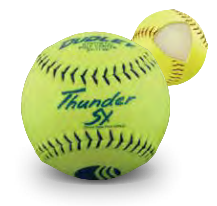
CLASSIC W STAMP Item# 4U-542Y • Cover: Synthetic • Size: 11" COR: .44 • Compression: 400 lbs.