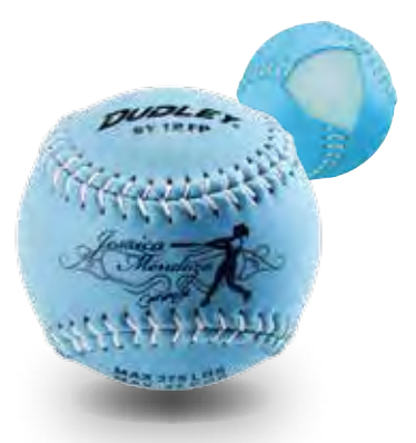
Item# 4M-114 • Cover: Synthetic • Size: 12" COR: .47 • Compression: 375 lbs.