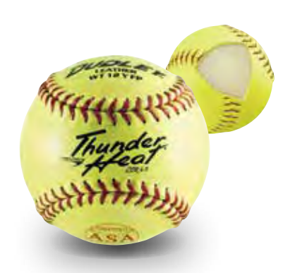
Item# 4A-147Y • Cover: Leather • Size: 12" COR: .47 • Compression: 375 lbs.