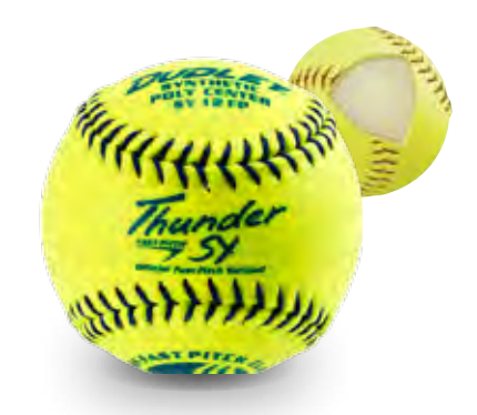
Item# 4U-913Y • Cover: Synthetic • Size: 12" COR: .47 • Compression: 375 lbs.