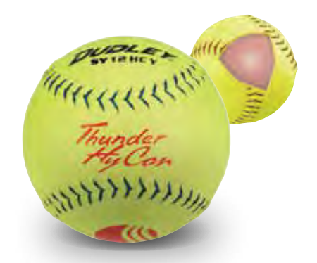
CLASSIC PLUS STAMP

Item# 4U-066Y • Cover: Composite • Size: 12" COR: .52 • Compression: 275 lbs.