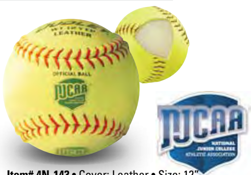
Item# 4N-143 • Cover: Leather • Size: 12 COR: .47 • Compression: 350 lbs. +/-50