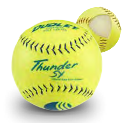
STADIUM STAMP Item# 4U-546Y • Cover: Synthetic • Size: 12" COR: .47 • Compression: 450 lbs.