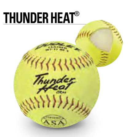
Item# 4A-541Y • Cover: Leather • Size: 11" COR: .44 • Compression: 375 lbs.