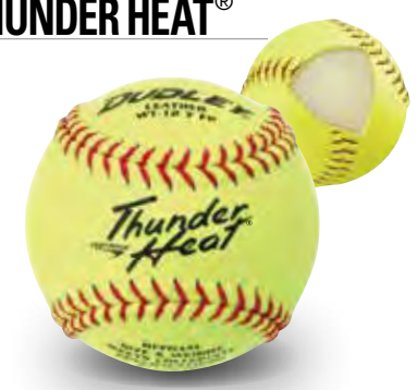
Item# 43-147Y • Cover: Leather Size: 12" • COR: .47 • Compression: 375 lbs