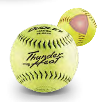
Item# 4E-065Y • Cover: Leather • Size: 12" COR: .52 • Compression: 275 lbs.