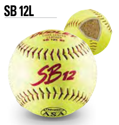
Item# 4A-137Y • Cover: Leather • Size: 12" COR: .44 • Compression: 375 lbs. Red Print & Stitching