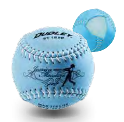
Iltem# 4M-116 • Cover: Synthetic • Size: 12" Raised Seams • Sponge Rubber Cover