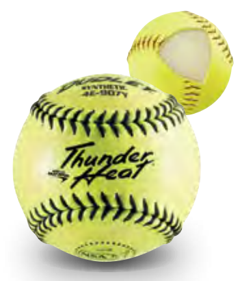
Item# 4E-907Y • Cover: Synthetic • Size: 12" COR: .52 • Compression: 275 lbs.