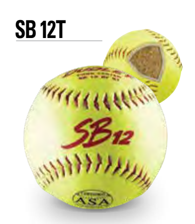
Item# 4A-729Y • Cover: Synthetic • Size: 12" COR: .44 • Compression: 375 lbs. Red Print & Stitching