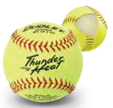
Item# 4H-147Y • Cover: Leather Size: 12" • COR: .47 • Compression: 375 lbs Mid-Seam Fast Pitch Softball