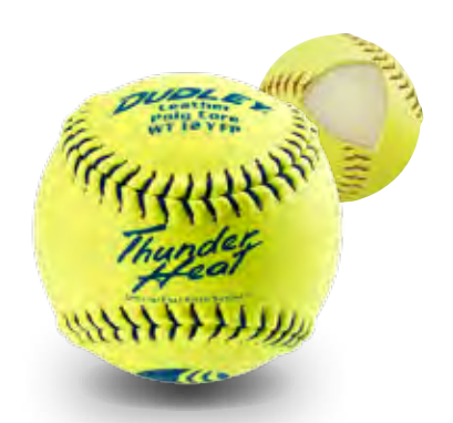
Item# 4U-147Y • Cover: Leather • Size: 12" COR: .47 • Compression: 375 lbs.