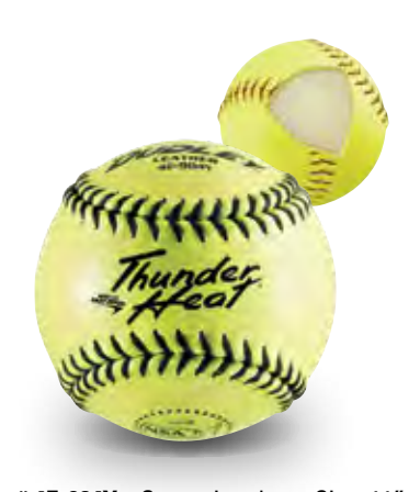
Item# 4E-904Y • Cover: Leather • Size: 11" COR: .52 • Compression: 275 lbs.