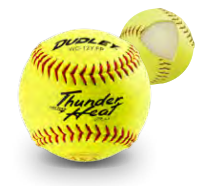
Item# 4A-132Y • Cover: Composite Size: 12" • COR: .47 • Compression: 375 lbs.