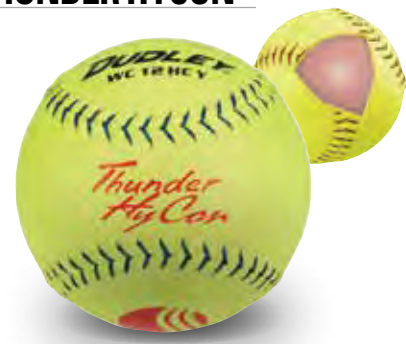
CLASSIC PLUS STAMP

Item# 4U-066Y • Cover: Composite • Size: 12" COR: .52 • Compression: 275 lbs.