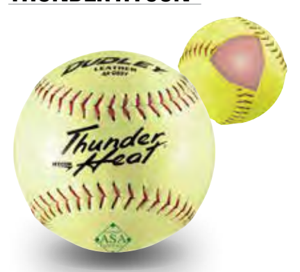
Item# 4A-065Y • Cover: Leather • Size: 12" COR: .52 • Compression: 300 lbs.