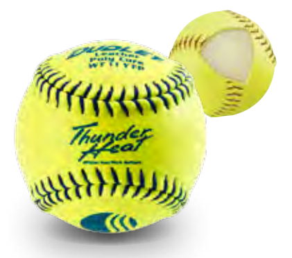
Item# 4U-531 • Cover: Leather • Size: 11" COR: .47 • Compression: 375 lbs.