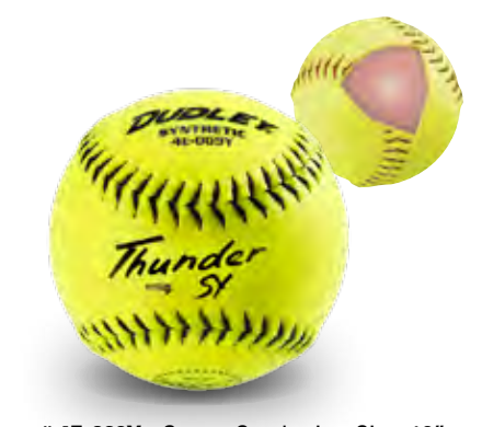
Item# 4E-069Y • Cover: Synthetic • Size: 12" COR: .52 • Compression: 275 lbs.