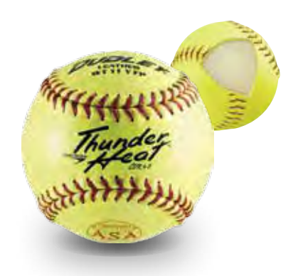
Item# 4A-531 • Cover: Leather • Size: 11" COR: .47 • Compression: 375 lbs.