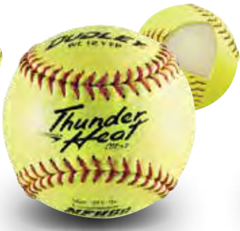
Item# 43-065Y • Cover: Composite 375 lbs.