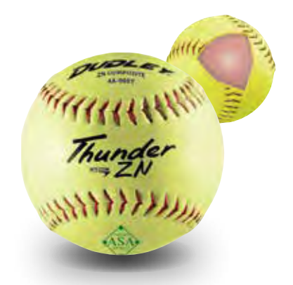
Item# 4A-068Y • Cover: Composite • Size: 12" COR: .52 • Compression: 300 lbs.