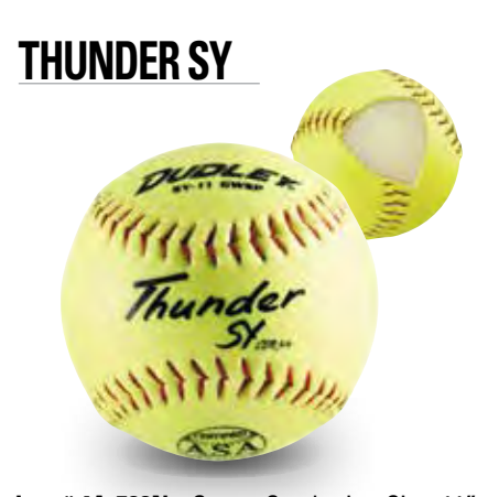
Item# 4A-722N • Cover: Synthetic • Size: 11" COR: .44 • Compression: 375 lbs.