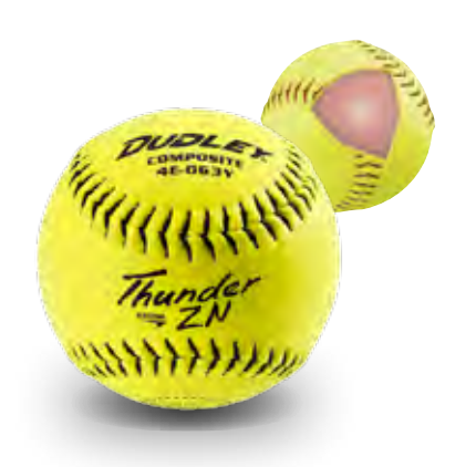
Item# 4E-063Y • Cover: Composite • Size: 11" COR: .52 • Compression: 275 lbs.