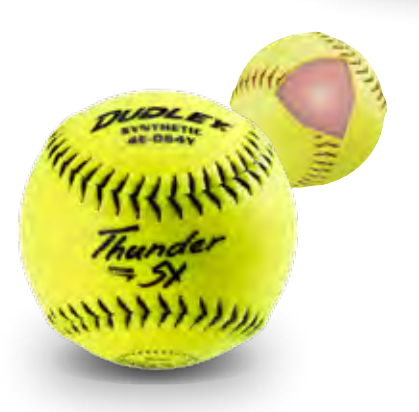
Item# 4E-064Y • Cover: Synthetic • Size: 11" COR: .52 • Compression: 275 lbs.