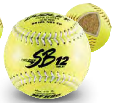
Item# 4Y-321 • Cover: Leather • Size: 12" COR: .47 • Compression: 375 lbs. • White stitching