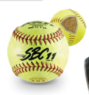
Item# 4Y-611 • Cover: Leather • Size: 11" COR: .47 • Compression: 375 lbs.