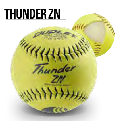
CLASSIC M STAMP Item# 4U-540Y • Cover: Composite Size: 12" • COR: .40 Compression: 325 lbs.