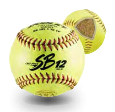
Item# 4A-311Y • Cover: Leather • Size: 12" COR: .47 • Compression: 375 lbs.