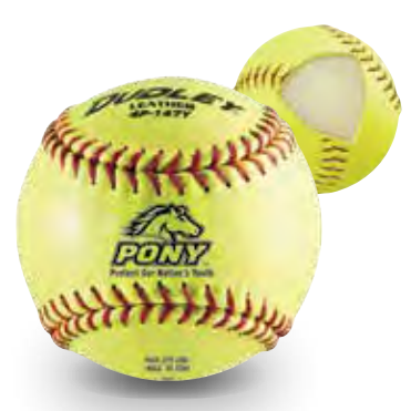
Item# 4P-147Y • Cover: Leather • Size: 12" COR: .47 • Compression: 375 lbs.