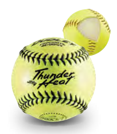
Item# 4E-905Y • Cover: Composite • Size: 12" COR: .52 • Compression: 275 lbs.