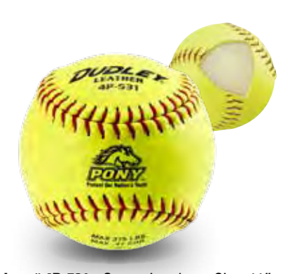
Item# 4P-531 • Cover: Leather • Size: 11" COR: .47 • Compression: 375 lbs.