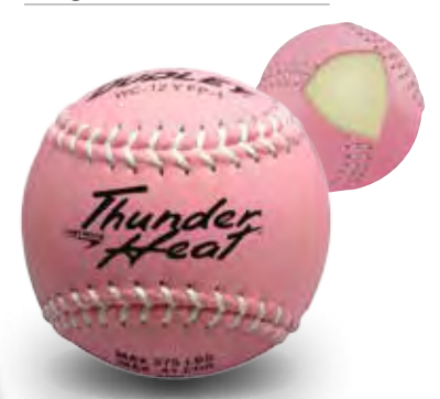
Item# 43-874 • Cover: Composite • Size: 12" COR: .47 • Compression: 375 lbs. Pink with White Stitching