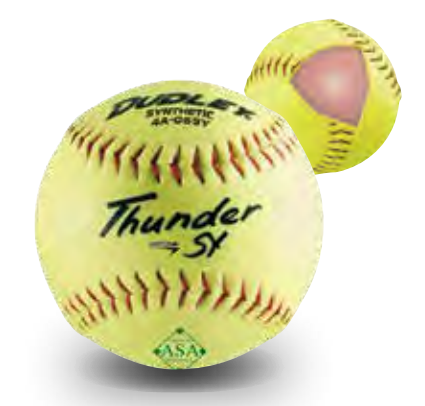
Item# 4A-069Y • Cover: Synthetic • Size: 12" COR: .52 • Compression: 300 lbs.