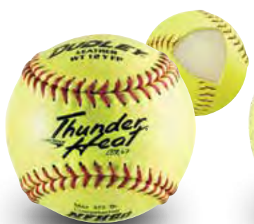
Item# 43-147 • Cover: Leather Size: 12" • COR: .47 • Compression: 375 lbs.