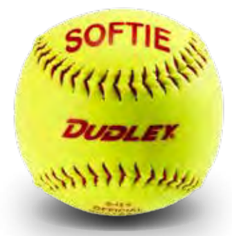
Item# 4Y-994 • Cover: Synthetic • Size: 12"