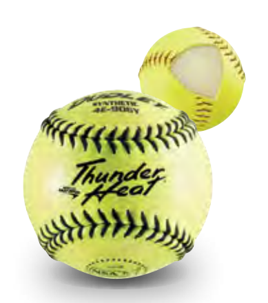
Item# 4E-906Y • Cover: Synthetic • Size: 11" COR: .52 • Compression: 275 lbs.