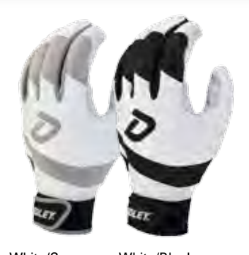
White/Gray White/Black » Lightning Additional Colors: