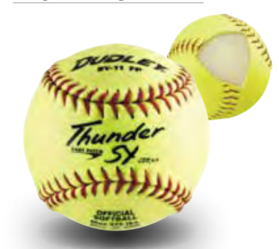
Item# 43-712Y • Cover: Synthetic • Size: 11" COR: .47 • Compression: 375 lbs.