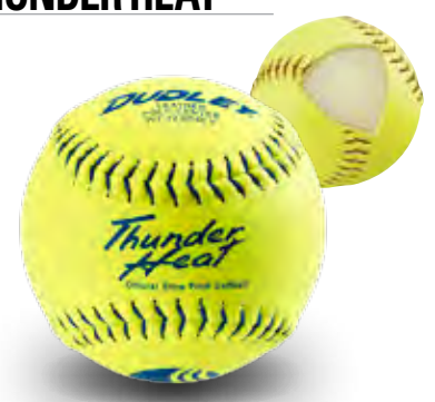
CLASSIC M STAMP

Item# 4U-551Y • Cover: Leather • Size: 12" COR: .40 • Compression: 325 lbs.