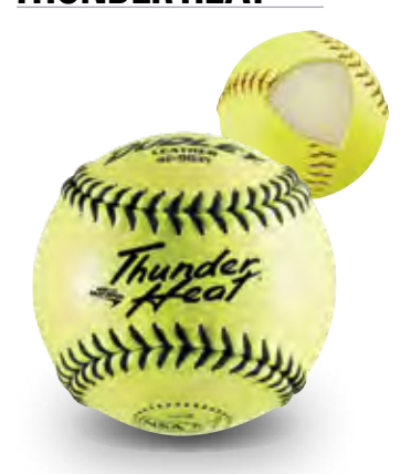
Item# 4E-903Y • Cover: Leather • Size: 12" COR: .52 • Compression: 275 lbs.