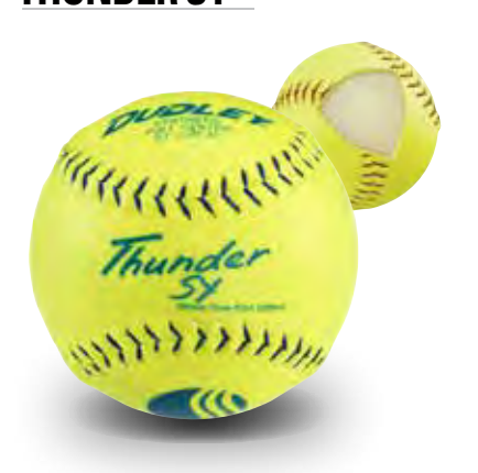
CLASSIC M STAMP Item# 4U-541Y • Cover: Synthetic • Size: 12" COR: .40 • Compression: 325 lbs.