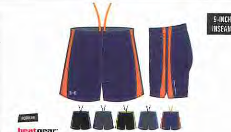
REGULAR heatgear 1217775 ESCAPE 9-INCH KNIT SHORT

Lightweight knit / Mesh insets / Dual-Function HeatGear® liner with support up front and ventilation in back / Anti-odor brief liner with sublimated print / Interior key pocket / Front pockets / 360° Reflectivity