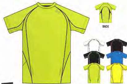
REGULAR heatgear 1217796 DRAFT SHORTSLEEVE CATALYST T

100% recycled Catalyst fabric / Mesh insets / Raglan sleeves and flatlock stitching for chafe-free performance / Rear hidden zippered pocket / Anti-odor technology / 360° Reflectivity with reflective rear catalyst logo