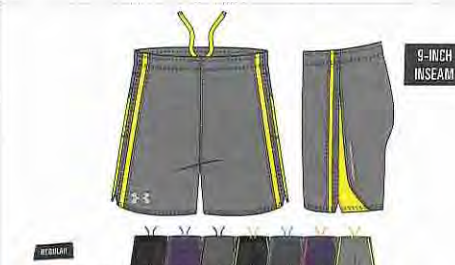
REGULAR heatgear 1207987 TRANSIT 9-INCH WOVEN SHORT

Lightweight durable woven fabric / Inset mesh panel for premium ventilation / Dual-function HeatGear® liner with support up front and ventilation in back / Bamboo charcoal anti-odor brief liner / Interior key pocket / Front pockets / 360° Reflectivity