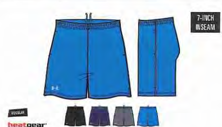
REGULAR heatgear 1100239 ESCAPE 7-INCH SHORT

Lightweight durable woven fabric / Cut with a generous, loose fit / Dual-Function HeatGear® liner with support up front and ventilation in back / Interior key pocket / Front hand pockets / Reflective UA logo