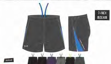
REGULAR heatgear 1217774 ESCAPE 7-INCH MESH SHORT

Under Armour®'s best selling Run short now gets mesh insets / Lightweight durable woven fabric / Dual-Function HeatGear® liner with support up front and ventilation in back / Bamboo charcoal anti-odor technology brief liner / Interior key pocket / Front pockets / 360° Reflectivity