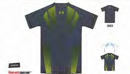
REGULAR heatgear 1217789 ESCAPE SUBLIMATED SHORTSLEEVE T

Ultra lightweight HeatGear® fabric / All over pique mesh for premium ventilation / Sublimated front graphic / Raglan sleeves and flatlock stitching for chafe-free performance / Under Armour® performance back neck tape / Reflective rear heatseal