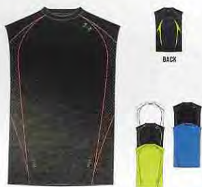
REGULAR heatgear 1217795 DRAFT SLEEVELESS CATALYST T

WICK MOISTURE REGULATE BODY TEMPERATURE FEEL LIGHT & COMFORTABLE