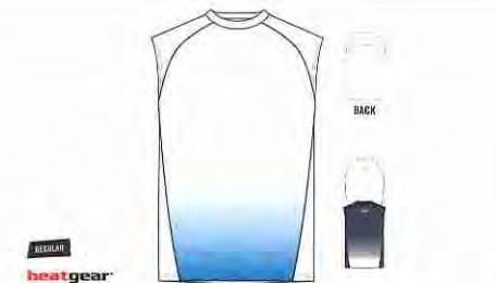
REGULAR heatgear 1217788 ESCAPE SUBLIMATED SLEEVELESS T

Ultra lightweight HeatGear® fabric / All over pique mesh for premium ventilation / Sublimated front graphic / Raglan sleeves and flatlock stitching for chafe-free performance / Under Armour® performance back neck tape / Reflective rear heatseal