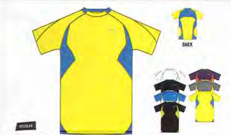
REGULAR heatgear 1217786 ESCAPE SHORTSLEEVE T

Lightweight HeatGear® / Mesh insets for premium ventilation / Offset side seams, raglan sleeves and flatlock stitching for chafe-free performance / Under Armour® performance back neck tape / Rear pocket for secure storage / Anti-odor technology / 360° Reflectivity