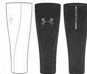
NEW 1217800 COMPETITION CALF SLEEVE

Stabilizes and minimizes muscle vibrations while running / Compression for improved oxygen supply to the calf muscles / Gets your muscles back to full strength faster / Flatlock stitching for chafe-free performance / 360° Reflectivity