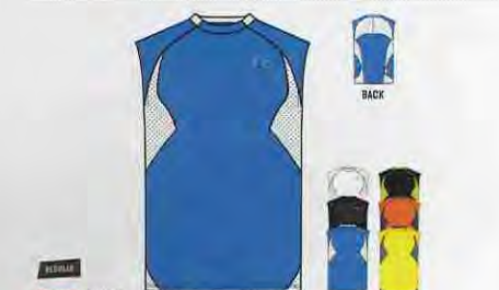
REGULAR heatgear 1217784 ESCAPE SLEEVELESS T

Lightweight HeatGear® / Mesh insets for premium ventilation / Offset side seams, raglan sleeves and flatlock stitching for chafe-free performance / Under Armour® performance back neck tape / Rear pocket for secure storage / Anti-odor technology / 360° Reflectivity