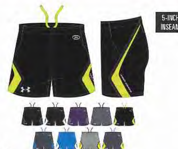
REGULAR heatgear 1221102 DRAFT 5-INCH CATALYST SHORT

100% recycled fabric / Durable woven / Mesh insets / Dual-Function HeatGear® liner with support up front and ventilation in back / Anti-odor technology brief liner with sublimated print / Interior key pocket / Rear pocket for secure storage / 360° Reflectivity