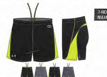
REGULAR heatgear 1217792 DRAFT 7-INCH CATALYST SHORT

100% recycled fabric / Durable woven / Mesh insets / Dual-Function HeatGear® liner with support up front and ventilation in back / Anti-odor technology brief liner with sublimated print / Interior key pocket / Energy gel loops on waistband for 2 fuel packs / 2 rear hidden zip pocket for secure storage / 360° Reflectivity