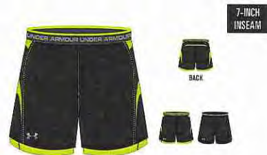
NEW 1217798 CHAFE-FREE 2-IN-1 7-INCH RUN SHORT

Anti-chafe internal signature HeatGear® Under Armour® compression short / Lightweight durable woven fabric outer / Mesh insets for premium ventilation / Performance waistband for maximum comfort / 2 side holster gel pockets / 360° Reflectivity