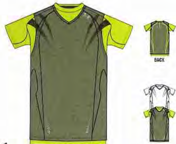
NEW 1217797 CHAFE-FREE 2-IN-1 RUN TOP

Anti-chafe internal signature HeatGear® Under Armour® compression shirt / Ultra lightweight mesh sleeveless outer fabric / Flatlock stitching on internal compression shirt for chafe-free performance / 2 rear pockets on internal compression shirt for next to skin secure storage / Screen print graphic on internal compression shirt / 360° Reflectivity