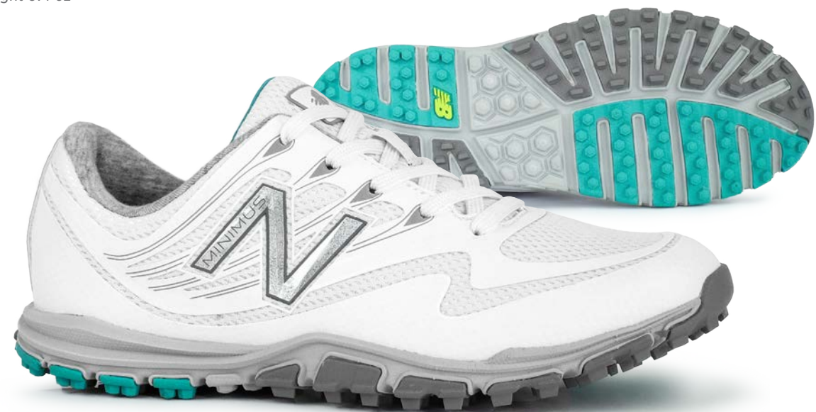
NBGW1006WT White Widths: B: 6-11 Availability: 9/15/17