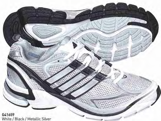
G41659 White / Black / Metallic Silver

miCoach adiWEAR® 6 FORMOTION™ adiPRENE® adiWEAR® 6 adiLITE™ adiPRENE®+ TORSION™ SYSTEM pro-moderator