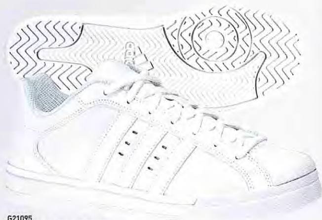
G21095 White / White / Metallic Silver