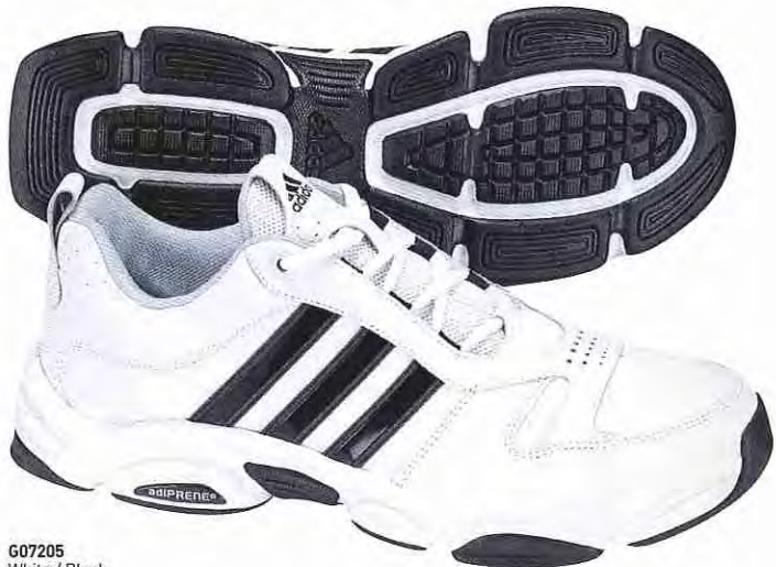
G07205 White / Black