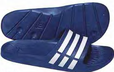
G15892 New Navy / White