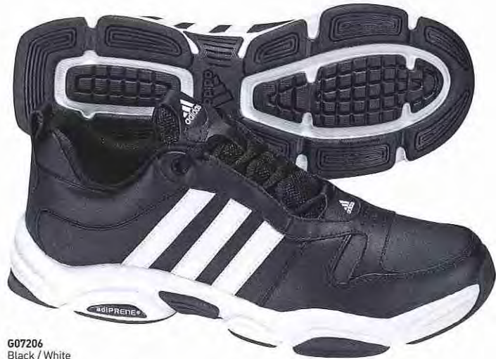
G07206 Black / White