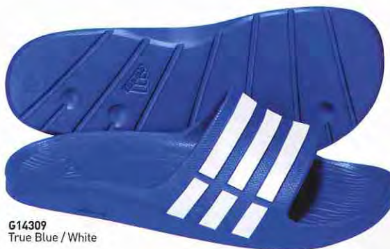
G14309 True Blue / White