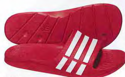
G15886 Coll Red / White