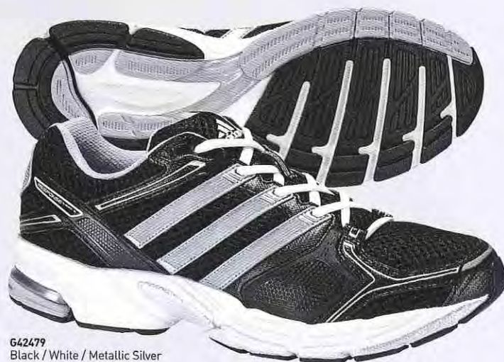
G42479 Black / White / Metallic Silver