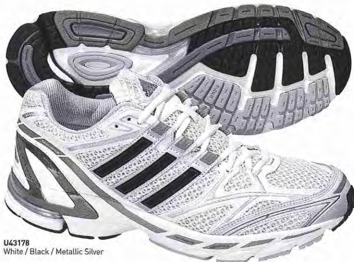
U43178 White / Black / Metallic Silver