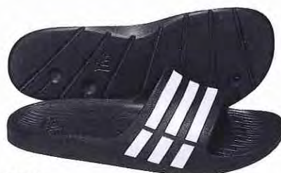
G15890 Black / White