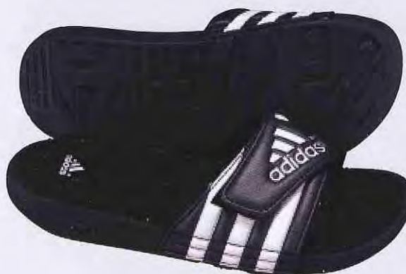
087609 women's Black / White