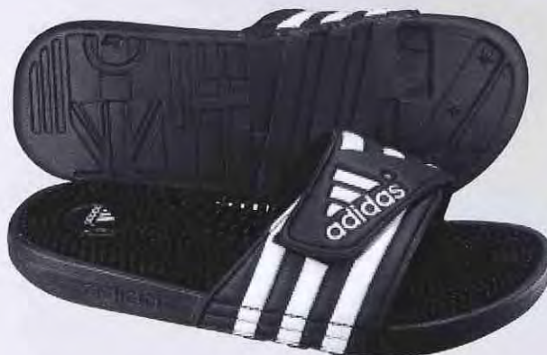
078260 men's Black / White