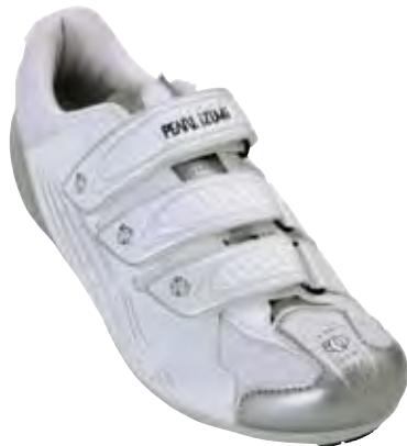
White/ Silver – 223