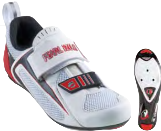
White/True Red -2KA

38-46 (in 1/2 sizes) 47, 48 235g - EU Size 43