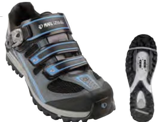
Vapor/ Martini – 847

36-43 (whole sizes) Weight: 390g (size 40)