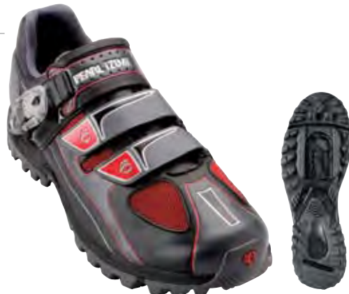
Black/ Moonlight – 589

38-49 (whole sizes) Weight: 390g (size 40)