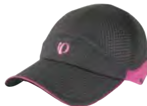
Shadow Grey/ Rosebloom - 2XQ