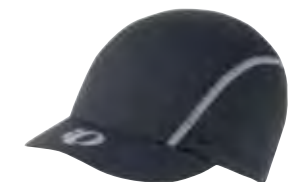
Black - 021