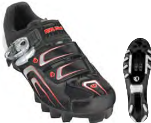
Martini/ Silver – 2WN