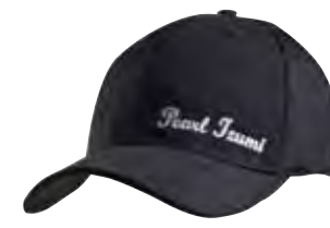
Retro - 165