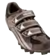
Coffee/ Black – 2YI