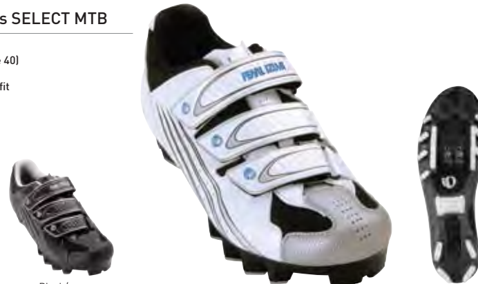
White/Silver – 223