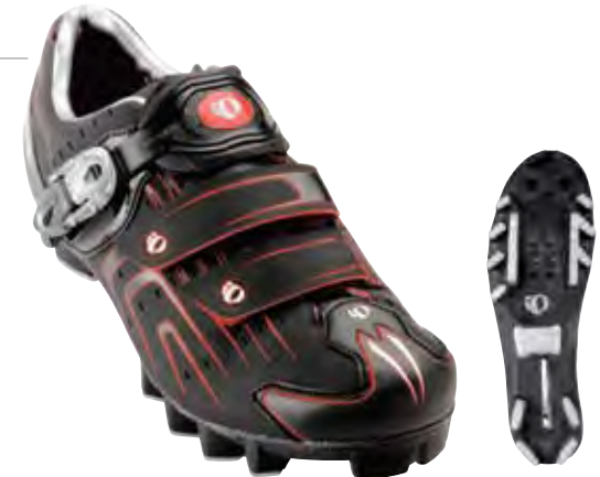
Black/Black - 027

38-47 in 1/2 sizes, 48 Weight: 390g (size 43)