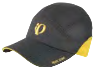
Shadow Grey/ Curry - 2XR