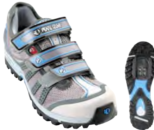
Martini/ Shadow Grey – 3CQ

36-43 [whole sizes] Weight: 362g (size 40)