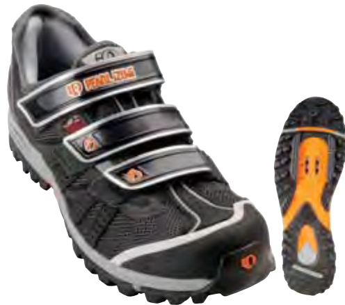
Shadow Grey/ Martini – 2XC

39-49 [whole sizes] Weight: 390g (size 43)