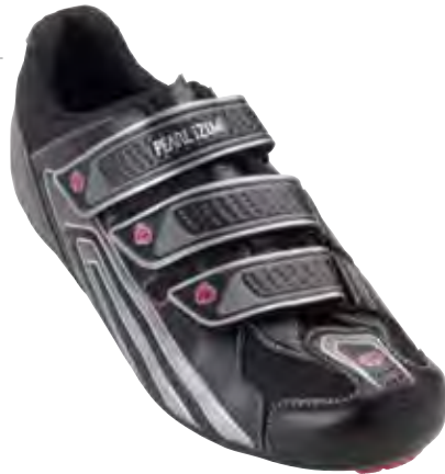
Black/ Silver – 528

39-47 in 1/2 sizes, 48, 49 Weight: 265g (size 43) SPD COMPATIBLE