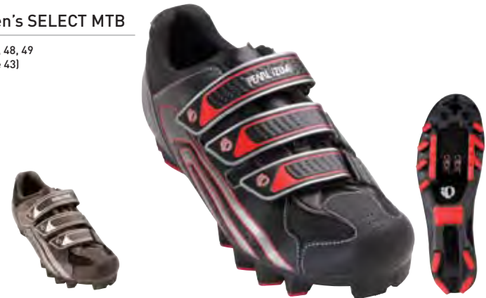
Black/True Red – 2FK

39-47 in 1/2 sizes, 48, 49 Weight: 351g (size 43)