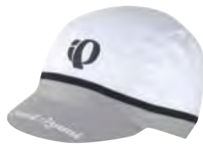
White - 508