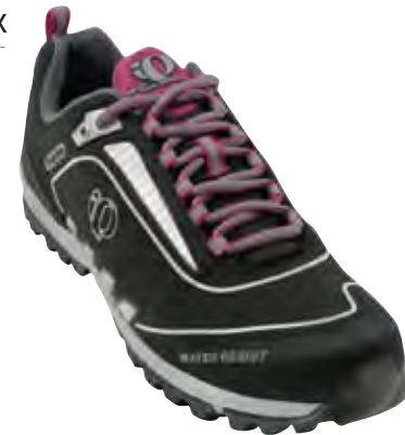
Black/ Purple Wine - 2PC

36-43 (whole sizes) Weight: 390g (size 40)