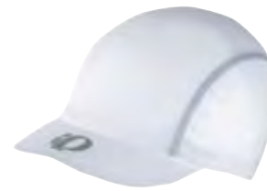
White - 508