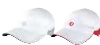
White/ Limestone - 20K White/ Cardinal - 2WB