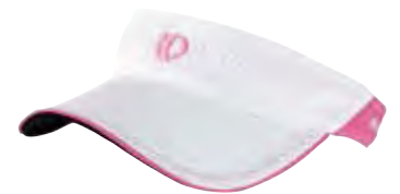
White/Rosebloom - 2XE