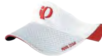
White/ True Red - 2KA