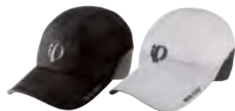
Black/ Shadow Grey - 2FJ White/ Shadow Grey - 2JZ