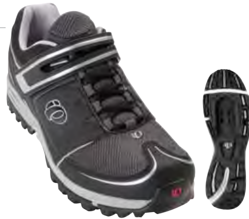
Black/ Silver – 528

38-49 (whole sizes) Weight: 385g (size 43)