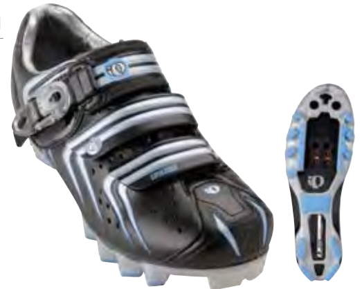
Black / Silver - 528