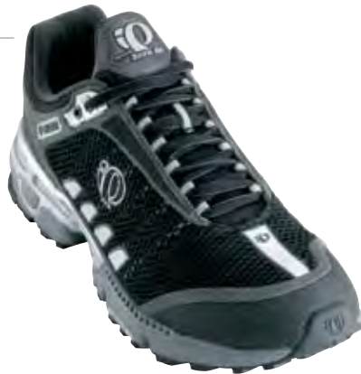
Black/Shadow grey - 2FJ

38-49 (whole size) Weight: 355g - EU Size 43