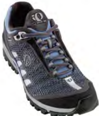
Shadow Grey/ Horizon Blue - 2WY

36-43 (whole sizes) Weight: 424g - EU Size 38