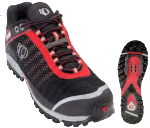
Black/ Shadow Grey – 2FJ

38-49 [whole sizes] Weight: 425g (size 43)