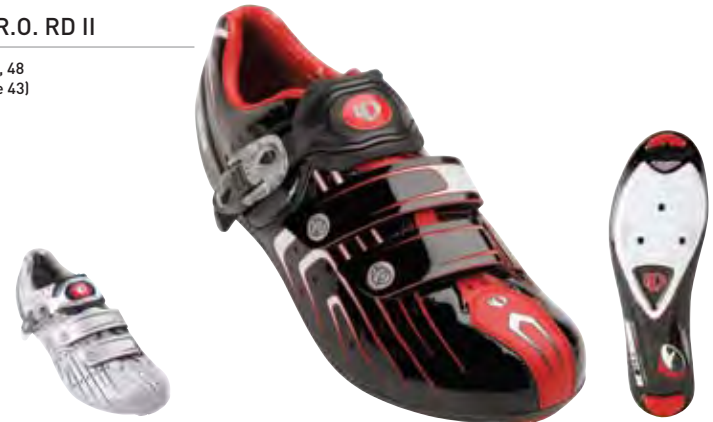
White/ True Red - 2KA

38-47 in 1/2 sizes, 48 Weight: 275g (size 43)