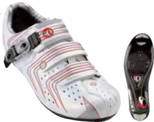
White/Silver - 223