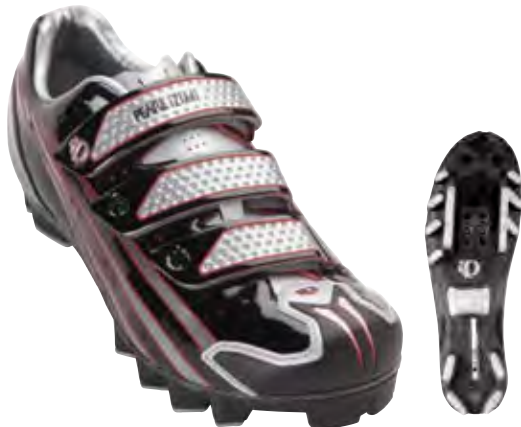
Black/Silver - 528

38-47 in 1/2 sizes, 48 Weight: 335g (size 43)