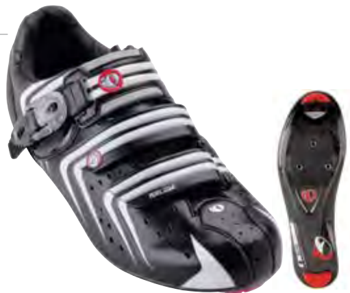
Black/ White - 065

39-47 in 1/2 sizes, 48 Weight: 277g (size 43)