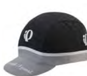
Black - 021