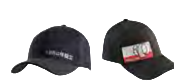
Black/ White - 065 Black Red - 054