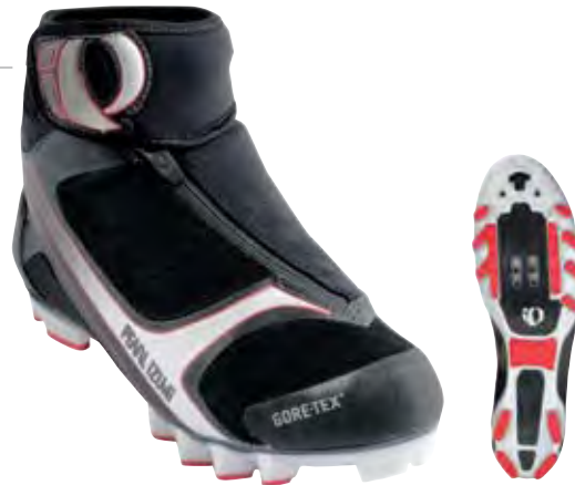
Black/ Silver - 528

38-47 in 1/2 sizes, 48 Weight: 455g (size 43)