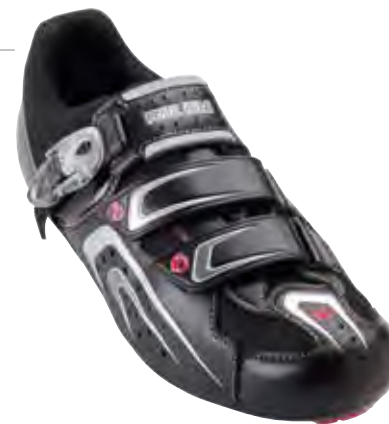
Black/ Shadow Grey - 2FJ

39-47 in 1/2 sizes, 48, 49 Weight: 292g (size 43) SPD COMPATIBLE