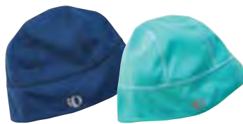
Midnight Blue -2XV