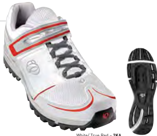
White/ True Red – 2KA

36-43 (whole sizes) Weight: 335g (size 40)