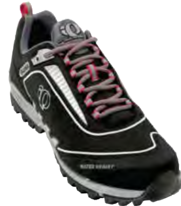
Black/ True Red - 2FK

38-49 (whole sizes) Weight: 401g (size 43)