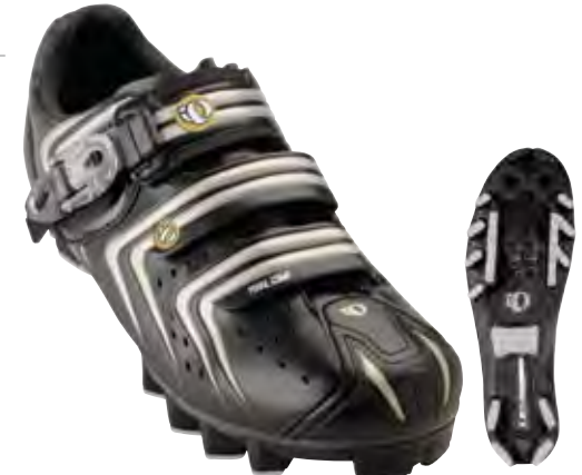
Black/Silver - 528

39-47 in 1/2 sizes, 48 Weight: 380g (size 43)