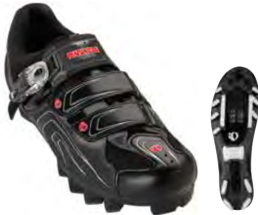
Martini/ Silver – 2WN

39-47 in 1/2 sizes, 48, 49 Weight: 374g (size 43)