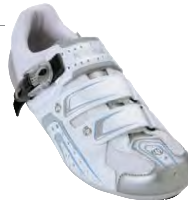
White/ Silver - 223