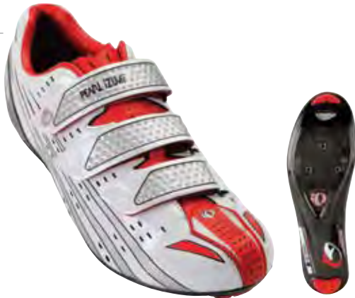
White / True Red - 2KA

38-47 in 1/2 sizes, 48 Weight: 235g (size 43)