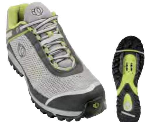
Martini/ Shadow Grey – 3CQ

36-43 [whole sizes] Weight: 375g (size 40)