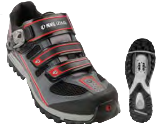
Black/ Shadow Grey – 2FJ

39-49 (whole sizes) Weight: 440g (size 43)