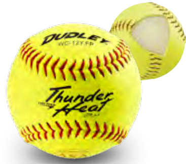
Item# 4A-132Y • Cover: Composite Size: 12" • COR: .47 • Compression: 375 lbs.