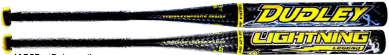
LLBSP • (Balanced)