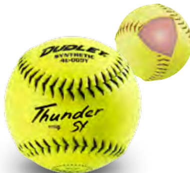
Item# 4E-069Y • Cover: Synthetic • Size: 12" COR: .52 • Compression: 275 lbs.