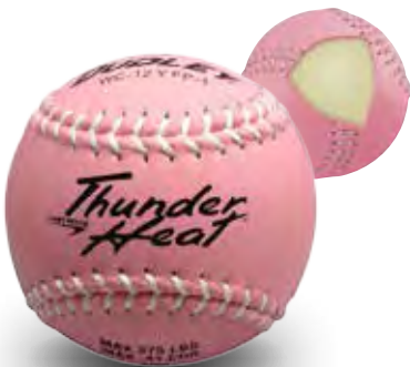
Item# 43-874 • Cover: Composite • Size: 12" COR: .47 • Compression: 375 lbs. Pink with White Stitching