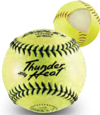
Item# 4E-904Y • Cover: Leather • Size: 11" COR: .52 • Compression: 275 lbs.