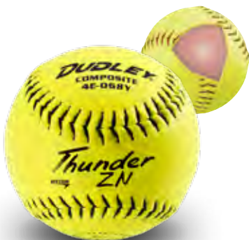
Item# 4E-068Y • Cover: Composite • Size: 12" COR: .52 • Compression: 275 lbs.