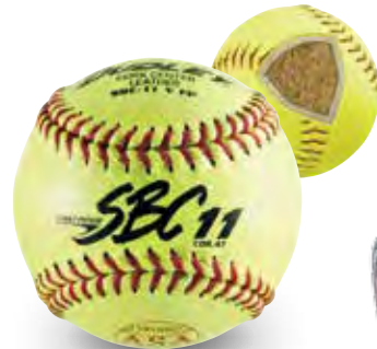
Item# 4Y-611 • Cover: Leather • Size: 11" COR: .47 • Compression: 375 lbs.