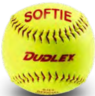
Item# 4Y-994 • Cover: Synthetic • Size: 12"