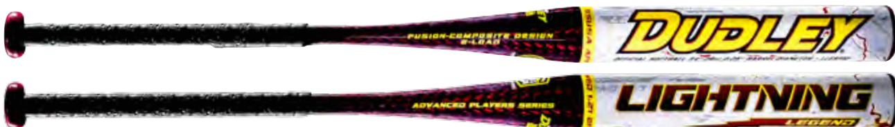
LLESP12 • (End-Loaded)