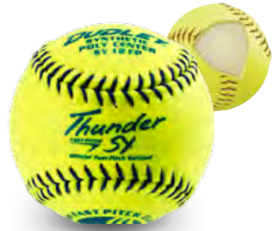
Item# 4U-913Y • Cover: Synthetic • Size: 12" COR: .47 • Compression: 375 lbs.