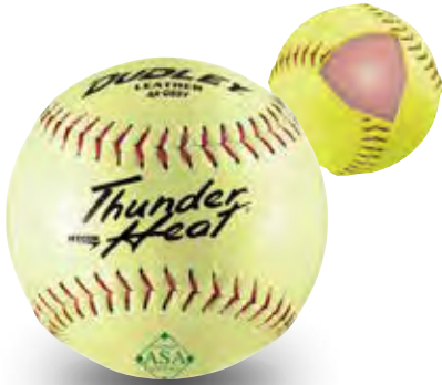
Item# 4A-065Y • Cover: Leather • Size: 12" COR: .52 • Compression: 300 lbs.