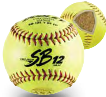
Item# 4A-311Y • Cover: Leather • Size: 12" COR: .47 • Compression: 375 lbs.