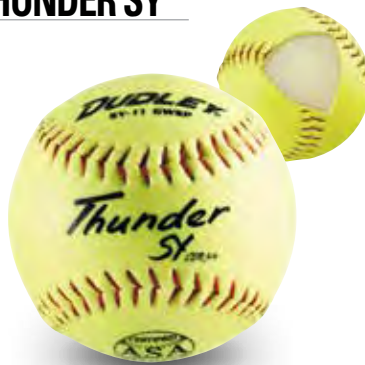
Item# 4A-722N • Cover: Synthetic • Size: 11" COR: .44 • Compression: 375 lbs.