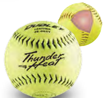
Item# 4E-065Y • Cover: Leather • Size: 12" COR: .52 • Compression: 275 lbs.