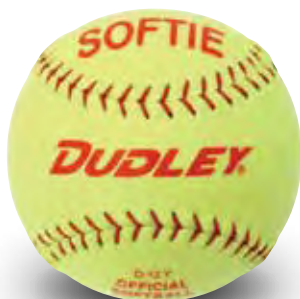
Item# 4Y-993 • Cover: Synthetic • Size: 11"