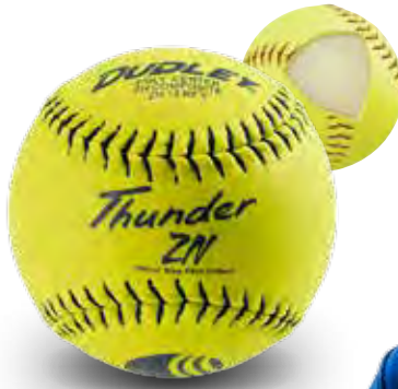
STADIUM STAMP Item# 4U-528Y • Cover: Composite Size: 12" • COR: .47 Compression: 450 lbs.