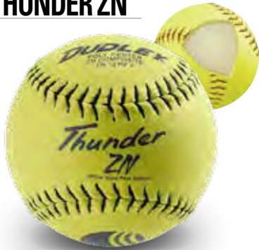
CLASSIC M STAMP Item# 4U-540Y • Cover: Composite Size: 12" • COR: .40 Compression: 325 lbs.