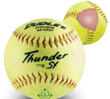
Item# 4A-069Y • Cover: Synthetic • Size: 12" COR: .52 • Compression: 300 lbs.