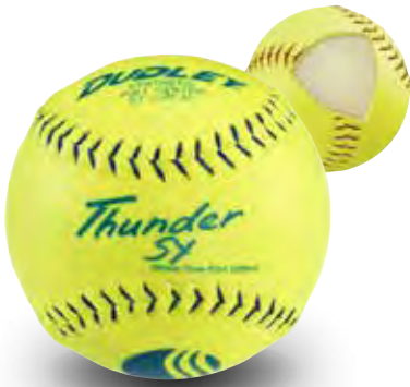
CLASSIC M STAMP Item# 4U-541Y • Cover: Synthetic • Size: 12" COR: .40 • Compression: 325 lbs.