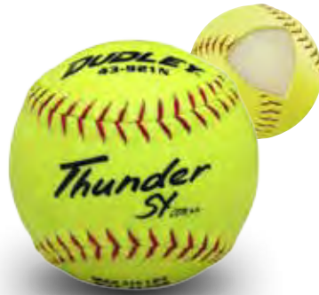
Item# 43-921N • Cover: Synthetic • Size: 12" COR: .44 • Compression: 375 lbs.