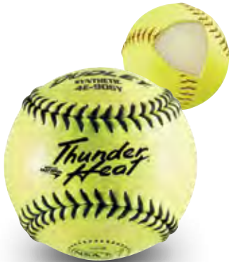
Item# 4E-906Y • Cover: Synthetic • Size: 11" COR: .52 • Compression: 275 lbs.