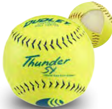
STADIUM STAMP Item# 4U-546Y • Cover: Synthetic • Size: 12" COR: .47 • Compression: 450 lbs.