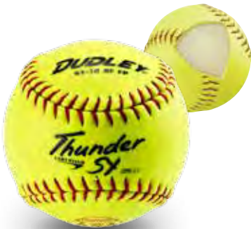
Item# 4A-913Y • Cover: Synthetic • Size: 12" COR: .47 • Compression: 375 lbs.