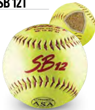
Item# 4A-729Y • Cover: Synthetic • Size: 12" COR: .44 • Compression: 375 lbs. Red Print & Stitching