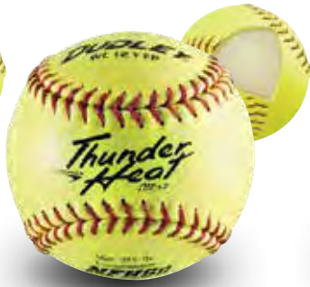
Item# 43-065Y • Cover: Composite Size: 12" • COR: .47 • Compression: 375 lbs.