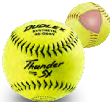
Item# 4E-064Y • Cover: Synthetic • Size: 11" COR: .52 • Compression: 275 lbs.