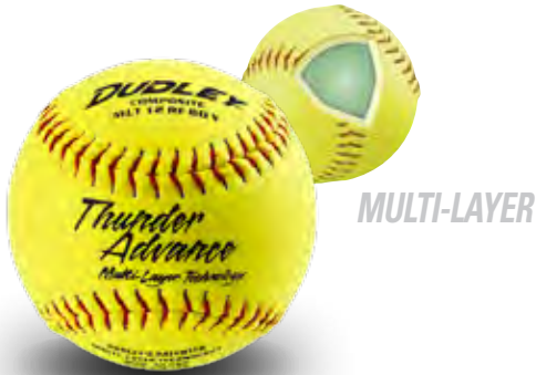
Item# 43-184Y • Cover: Composite • Size: 12" COR: .44 • Compression: 375 lbs.