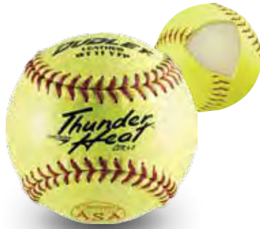
Item# 4A-531 • Cover: Leather • Size: 11" COR: .47 • Compression: 375 lbs.