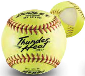
Item# 43-147 • Cover: Leather Size: 12" • COR: .47 • Compression: 375 lbs.