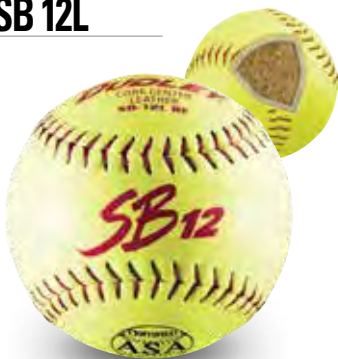
Item# 4A-137Y • Cover: Leather • Size: 12" COR: .44 • Compression: 375 lbs. Red Print & Stitching