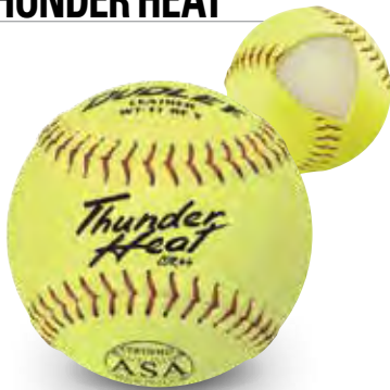
Item# 4A-541Y • Cover: Leather • Size: 11" COR: .44 • Compression: 375 lbs.