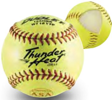
Item# 4A-147Y • Cover: Leather • Size: 12" COR: .47 • Compression: 375 lbs.