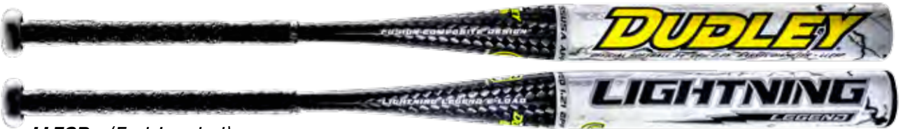
LLESP • (End-Loaded)