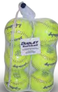
Item# 43-419Y • Cover: Synthetic • Size: 12"