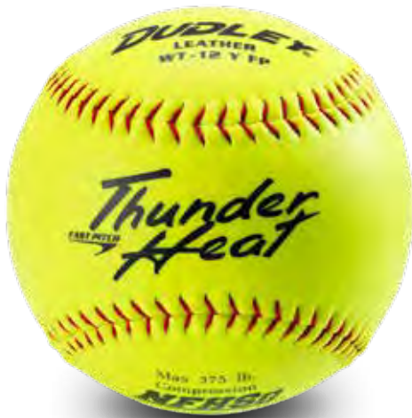
21" TROPHY BALL