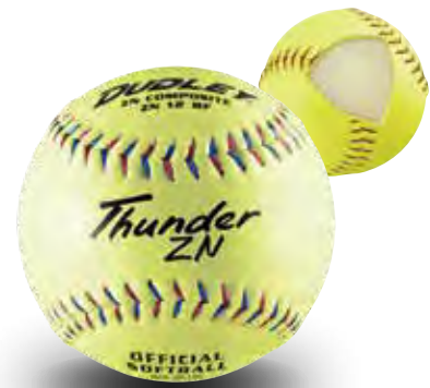
Item# 43-055 • Cover: Composite • Size: 12" COR: .44 • Compression: 525 lbs.