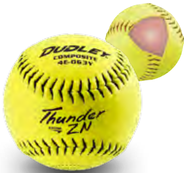
Item# 4E-063Y • Cover: Composite • Size: 11" COR: .52 • Compression: 275 lbs.