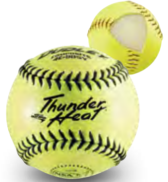
Item# 4E-905Y • Cover: Composite • Size: 12" COR: .52 • Compression: 275 lbs.