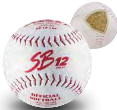
Item# 43-311 • Cover: Leather • Size: 12" COR: .47 • Compression: 375 lbs. Red Print & Stitching