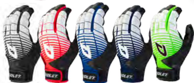
Black/White Black/Red Black/Royal Black/Navy Black/Neon Green