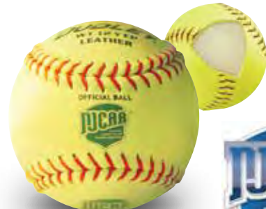
Item# 4N-143 • Cover: Leather • Size: 12" COR: .47 • Compression: 350 lbs. +/-50