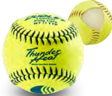
Item# 4U-531 • Cover: Leather • Size: 11" COR: .47 • Compression: 375 lbs.