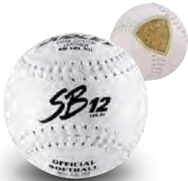
Item# 43-331 • Cover: Leather • Size: 12" COR: .47 • Compression: 375 lbs.