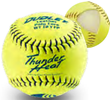
Item# 4U-147Y • Cover: Leather • Size: 12" COR: .47 • Compression: 375 lbs.