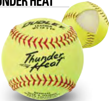
Item# 43-147Y • Cover: Leather Size: 12" • COR: .47 • Compression: 375 lbs