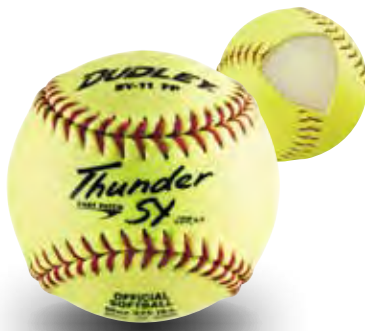
Item# 43-712Y • Cover: Synthetic • Size: 11" COR: .47 • Compression: 375 lbs.