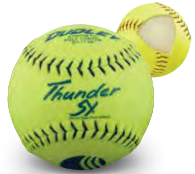
CLASSIC W STAMP Item# 4U-542Y • Cover: Synthetic • Size: 11" COR: .44 • Compression: 400 lbs.