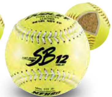
Item# 4Y-321 • Cover: Leather • Size: 12" COR: .47 • Compression: 375 lbs. • White stitching