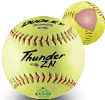
Item# 4A-068Y • Cover: Composite • Size: 12" COR: .52 • Compression: 300 lbs.