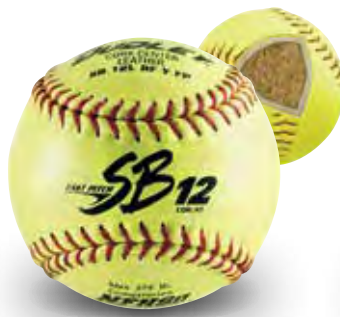
Item# 4H-311Y • Cover: Leather Size: 12" • COR: .47 • Compression: 375 lbs.