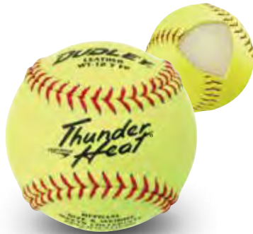
Item# 4H-147Y • Cover: Leather Size: 12" • COR: .47 • Compression: 375 lbs Mid-Seam Fast Pitch Softball