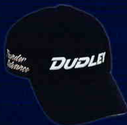
UNSTRUCTURED BLUE Item# 46-101