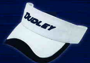
WHITE VISOR Item# 46-122