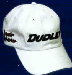
UNSTRUCTURED WHITE Item# 46-102