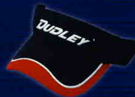
BLUE VISOR Item# 46-121