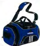
Striker Duffel p.79