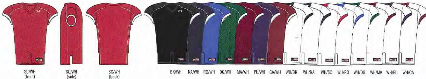
SC/WH (front) SC/WH (side) SC/WH (back)