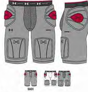
heatgear 1201500 MPZ® 3 DEMOLITION GIRDLE

Built in MPZ® hip, tail, and thigh pads / Dual Density hard shell thigh pad / Dual density hip bone protection in high impact area / MPZ® pad technology provides maximum mobility in a lightweight, breathable design / Anti-odor technology