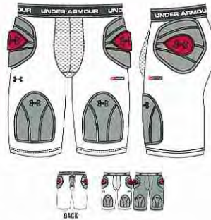
heatgear 1201503 MPZ® 2 HIP FLEX POWER GIRDLE

Built in MPZ® hip, tail, and thigh pads / Dual density hip bone protection in high impact area / MPZ® pad technology provides maximum mobility in a lightweight, breathable design / Anti-odor technology