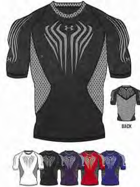
NEW heatgear 1217014 RED ZONE 1/2 SLEEVE COMPRESSION SHIRT

1/2 Sleeve design ends at elbow to provide more coverage / ArmourGrip™ Red Zone print on chest, shoulders and back help secure pads / Strategic ventilation throughout back and under arms