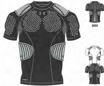
heatgear 1201509 MPZ® 2 BLAST JERSEY

Built in MPZ® shoulders, ribs, and spine pads / MPZ® pad technology provides maximum mobility in a lightweight, breathable design / ArmourGrip™ technology helps secure shoulder pads in place / Anti-odor technology / Strategic ventilation in high heat zones