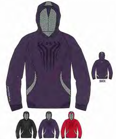
NEW heatgear 1217680 RED ZONE HOODY

Transitional weight double knit fabrication / Front kangaroo pocket / UA Red Zone speed graphic / Football sleeve screen print