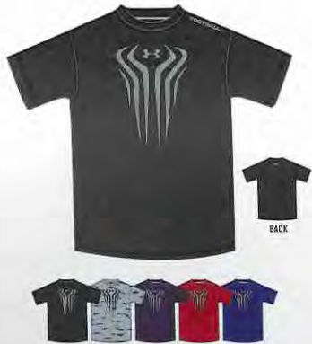
NEW heatgear 1217015 RED ZONE GRAPHIC T

UA Tech®: The Essential Under Armour® T / UA Red Zone speed graphic / Football screen print at shoulder seam