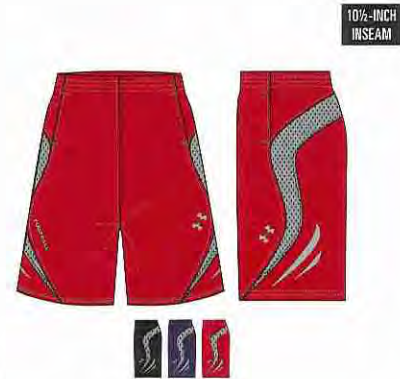
NEW heatgear 1217679 RED ZONE SHORT

Double knit textured fabrication / Side seam pockets / 10-inch inseam