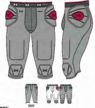
heatgear 1203641 MPZ® 2 STEALTH SYSTEM GIRDLE

Over the knee girdle provides full leg protection / Built in MPZ® hip, tail, and knee pads / MPZ® pad technology provides maximum mobility in a lightweight, breathable design / Anti-odor technology