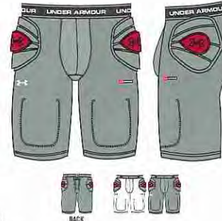
heatgear 1201505 MPZ® 2 HIP FLEX SKILL GIRDLE

Built in MPZ® hip and tail pads / Dual density hip bone protection in high impact area / MPZ® pad technology provides maximum mobility in a lightweight, breathable design / Internal thigh pad pockets / Anti-odor technology